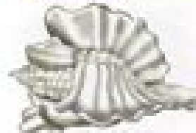
Foliate Thornmouth (W)

Cerithium foliatum To 1.5 in. (4 cm) high Shell has three large, leaf-like flanges. Color varies from white to dark brown depending on location.