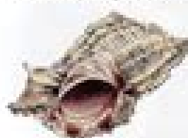
Apple Murex (CB)

Murex glaucus To 2 in. (5 cm) Elongate, pinkish-white to brownish shell with long ribs.