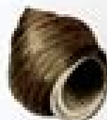
Common Periwinkle (B,V)

Littorina maritima To 1 in. (2 cm) high Grayish-white, sculpted shell has low spiral ridges. Common in marshes and estuaries.