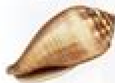
California Cone (CAS)

Alia carinata To 3 in. (7.5 cm) high Small shell has a pointed apex. Inside is pinkish white. Common in shallow water.