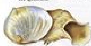
Solitary Glassy Bubble (V)

Conus septentrionalis To 3 in. (8 cm) Creamy shell has bands of red-brown splashes. Mouth is a long, dagger out of the narrow end of the shell.