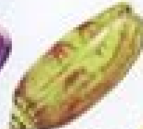
Lettered Olive (CB, CB)

Olivella biplicata To 1.5 in. (4 cm) high Smooth shell has a central spine. Color varies from purple to white and brown. Carnivorous scavenger feeds on animal remains. Shells were used by Native Americans in jewelry.