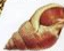
Channeled Nassa (CA)

Scaphella junonia johnstoni To 3 in. (7.5 cm) Deep water Gulf Coast shell only reaches up on shore after severe storms. Alabama's state shell.