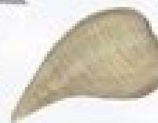
Common Fig Shell (CB)

Hydrobia ulitiformis To .75 in. (2 cm) Very fragile white to yellowish shell has a delicate lip. Shells are so light they are often transported to the highest tide line.