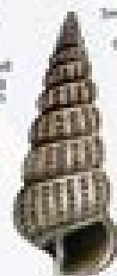
California Horn Snail (CAS)

Conus californicus To 1.5 in. (4 cm) high Smooth brownish shell has a fine spine. A carnivorous species that preys on prey with a harpoon-like tooth that injects poison. Do not handle live specimens.