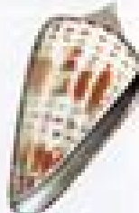
Alphabet Cone (CB)

Cerithium californicum To 1.8 in. (4.5 cm) Spiral high-spired shell is common on intertidal flats in estuaries and bays. Can climb trees and be out of water for extended periods.