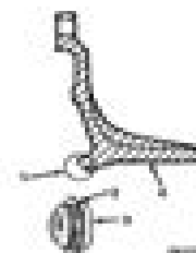
Figure 10.13. Bearing Housing with Groove and Coilant Seal with "O" Ring

20. Apply two small drops of Loctite® 290 to the shaft/coilant seal joint. Space each drop 180° apart.