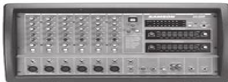
[ FRONT PANEL ]