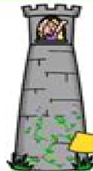
trapped in a tower