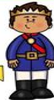
a prince comes to the rescue