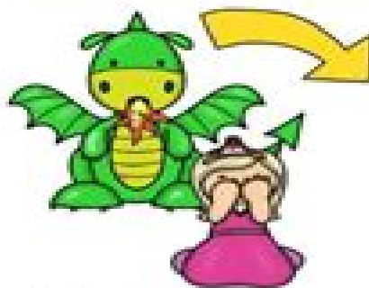
a fire-breathing dragon