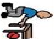
I find my airplane.