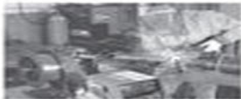
Figure 19-1. Backing material attached to the rear half of a workpiece.

The mechanical drawing methods are: 1) drawing, 2) contouring, 3) grinding, 4) machining, 5) cutting, and 6) sanding. Contour and finish are specified on the working surface with the quality or degree of finish specified by the manufacturer.