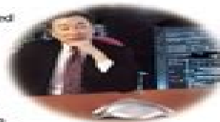
Conduct remote meetings...

If you work in a small to medium-sized business, chances are that you are still using low-quality, handset speakerphones to conduct important business with co-workers, and even customers. Handset speakerphones are fine for listening to voicemail or conducting short conversations, but usually fail to maintain natural two-way communication necessary to maximize productivity and conduct effect business meetings.