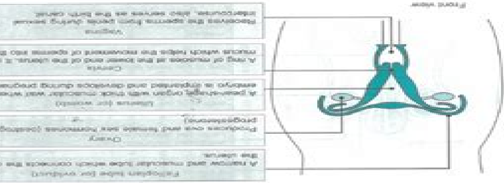
Figure 4.13 shows the structures and functions of the female reproductive system.

Learning Objectives The pathway of the sperm cells to the ovum. Testes → Sperm duct → Uterus → Vagina → Cervix → Uterus → Fallopian tube → Ovary