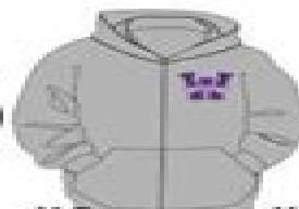
#9 GREY FULL ZIP PRINT