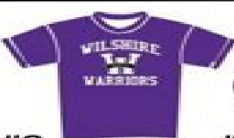
#2 PURPLE T-SHIRT - COTTON