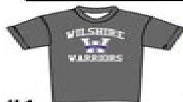
#1 DK GREY T-SHIRT - COTTON

NO REFUNDS OR EXCHANGES DUE TO INCORRECT SIZING