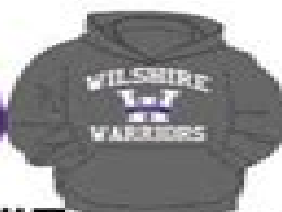
#7 DK GREY HOODY PRINT