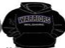
#8 BLACK HOODY EMBROIDERY