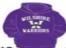
#6 PURPLE HOODY PRINT