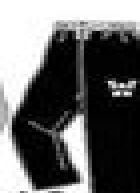
#10 BLACK SWEATPANTS PRINT