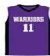
#12 Jersey BLACK& Purple

Name: _____ Teacher: _____ Room #: _____