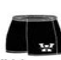
#11 BLACK DRYFIT SHORTS - PRINT