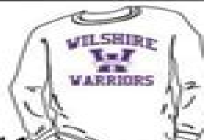
#4 WHITE LONGSLEEVE T