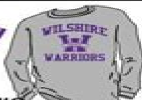
#3 GREY LONGSLEEVE T