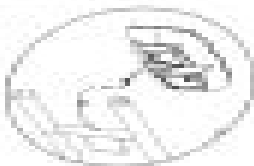
14. Composite Models Using Multiple Data Components Model: Hierarchical Bayesian Models