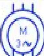
Three Phase Wound Rotor Motor