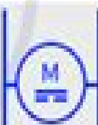
DC Shunt Motor