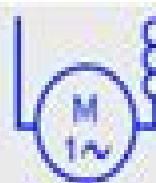
AC Single-Phase Series Motor