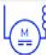
DC Series Motor