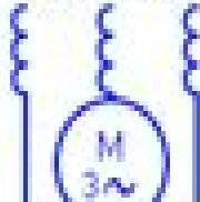
Three-Phase Series Motor