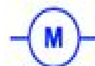
Generic Motor Symbol