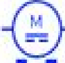
Permanent Magnet DC Motor