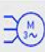
Three-Phase Electric Motor