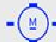
DC Compound Excitation Motor