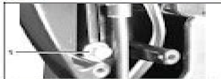
1. Mise en place de la poignée intérieure avec rondelle

Poser une rondelle, n° art. 328730, sur le vis de retenue de poignée intérieure. Appliquer une couche de Nut-Lock sur le bossage. Remettre vis en place.