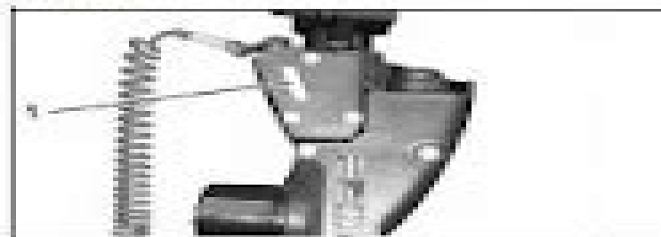
1. Marquage d'identification

Marquer l'interrupteur d'arrêt à l'aide d'un marqueur ou de peinture (BLANC (NE)). La barre étant relevée, combler la partie dentée de la plaque d'interrupteur d'arrêt pour indiquer que la campagne a été menée à bien.