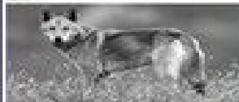
Downloaded At: 11:53 11 September 2009

1. The first step is to identify the problem. In this case, the problem is that the 2. company is not making enough profit. The second step is to analyze the 3. data. The third step is to develop a solution. The fourth step is to 4. implement the solution. The fifth step is to evaluate the results.