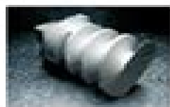
5 simultaneous axes