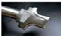
High grade PCD