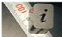
Micro finish cutting