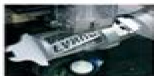
With rotary table