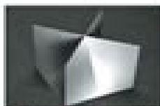
Tapering irregular figures