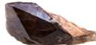
morion (smoky quartz)