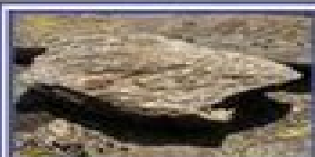
The Mica Group

is a variety of Zoisite. It is valued as a gem stone and has the chemical formula \text{Ca}_2\text{Al}_2\text{Si}_2\text{O}_{10}(\text{OH}) .