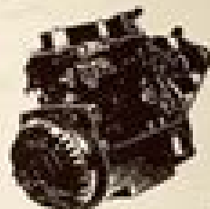
Fig. 1-2. Side view of the engine.