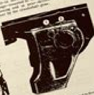
Fig. 1-4. Detail view of the engine.