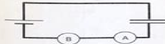
Figure 2: Will A and B light?