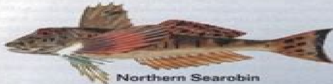
Northern Sea Robin