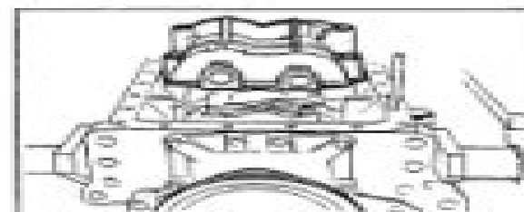
Fig. 40 - Counterbalance weights installed on engine.