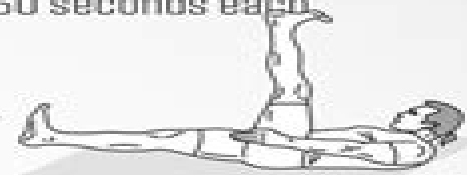
3. Low Boat Pose Scissors Variation Low Navasana Scissors Variation