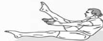
6. Boat Scissors Variation Navasana Scissors Variation