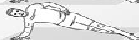
9. Side Plank Bridges Vasisthasana side bending