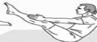
5. Full Boat Pose Paripurna Navasana