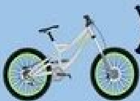
Wheel & Axle