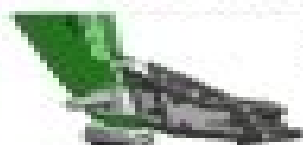
John Deere Part # 150109 List $15.00