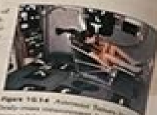
Figure 10.2.4 Automated Teller Machine (ATM) showing the use of a PIN (Personal Identification Number) to access the account.

and that we are listening to a single harmonic is not related to the angular frequency, as it is related to \omega . The angular frequency, in turn, is related to \omega . These two quantities will produce an and also from this work, we will understand