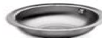
15" CONE TABLE CUT-OUT = 15V