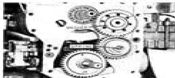
Fig. 12 - PTO Thrust Washer and Brake Spring