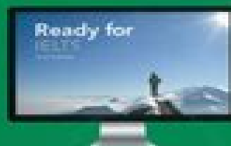
Teacher's Resource Centre with class audio Digital Student's Book eBook