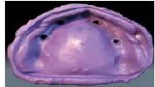
Fig. 1 & 2 Preliminary implant level impression