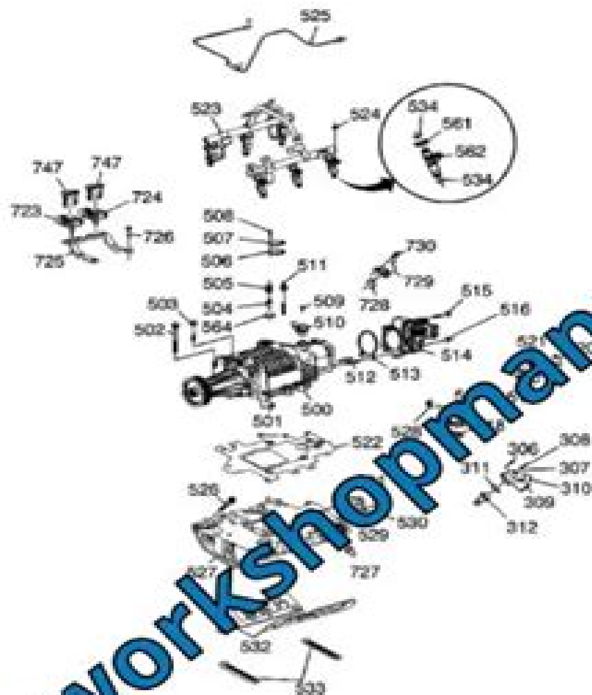
Fig. 4: Supercharger Component Views - L32 Courtesy of GENERAL MOTORS CORP.