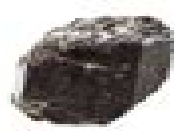
schorl (black tourmaline)