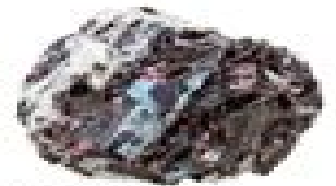
kyanite, biotite, tourmaline on gneiss