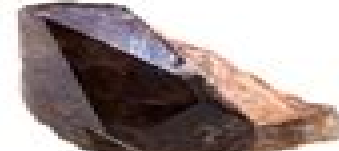
morion (smoky quartz)