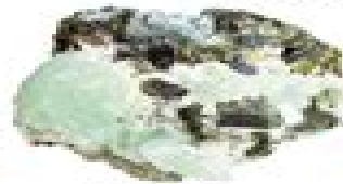
prehnite with epidote