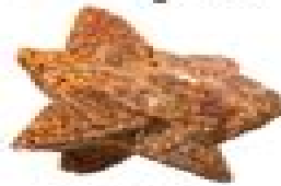
glendonite (ikaite calcite)