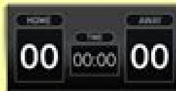
Sports Scores & Rankings