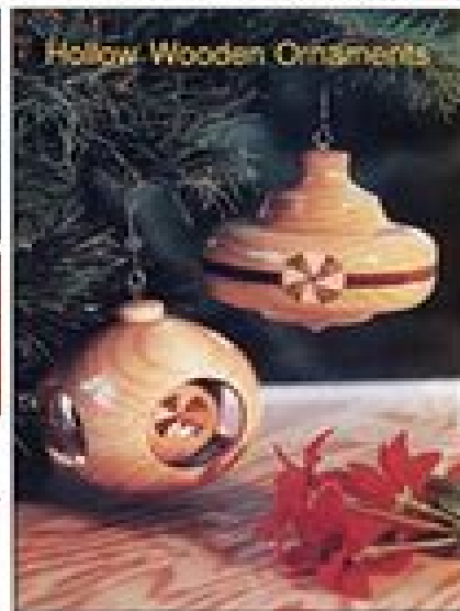
Hollow Wooden Ornaments