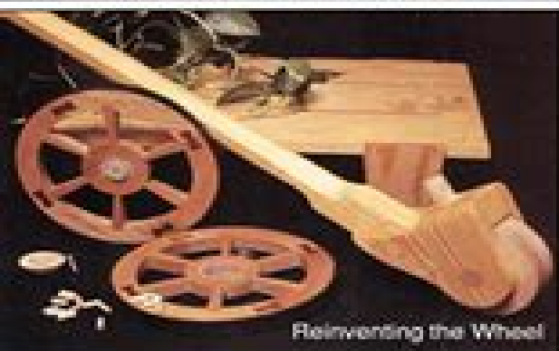
Reinventing the Wheel

Knock-Knock Shelf • Bear Chair • File Cabinet • Bull Year • Plant Box