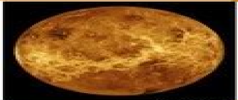
Our Solar System

called Earth's sister planet because of the size, second nearest planet from the sun