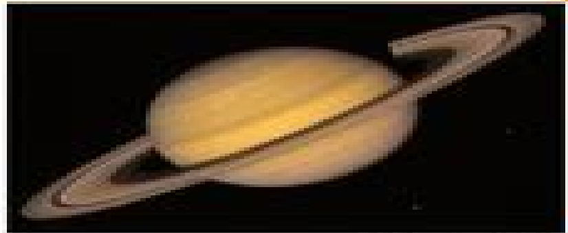
Our Solar System

sixth planet from the sun; second largest planet in the Solar System