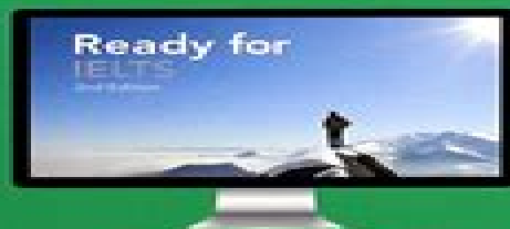
Teacher's Resource Centre with class audio Digital Student's Book eBook