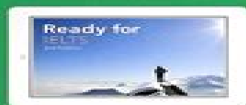
Student's Resource Centre with class audio