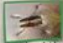
water skimmer / pond skater