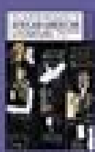
Volume 1: Eastern Minerals, Plutonium in the Present ISBN 0 7030 3413 0