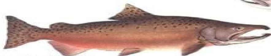
Spawning Chinook Salmon, Male