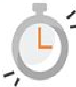
Ability to Work Under Pressure and Time Management