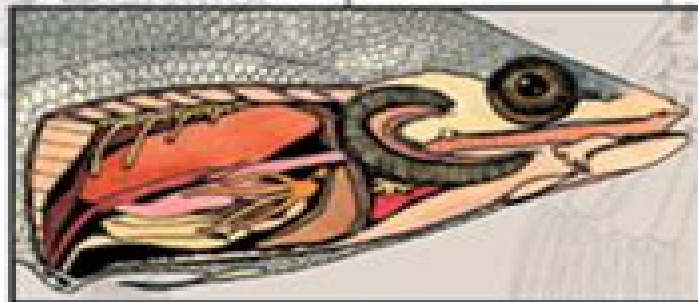
Figure 13. Internal anatomy of Perca mexicanorum .