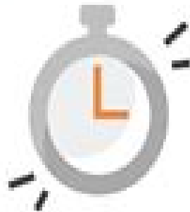
Ability to Work Under Pressure and Time Management