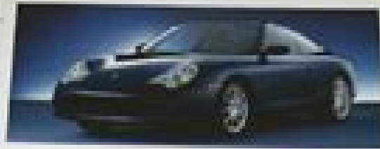
Owner's Manual Boxster