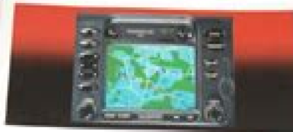
Porsche CarConnect infotainment Management (PCM)