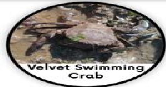
Velvet Swimming Crab