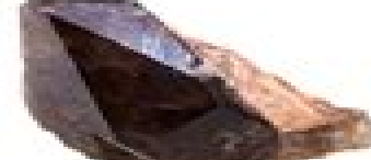
morion (smoky quartz)