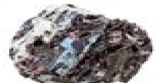
kyanite, biotite, tourmaline on gneiss