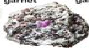
corundum on rock