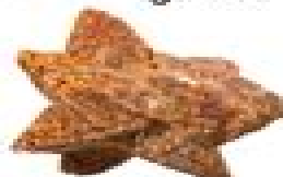
glendonite (ikaite calcite)