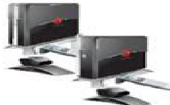
Five Telepresence m100 System Licenses