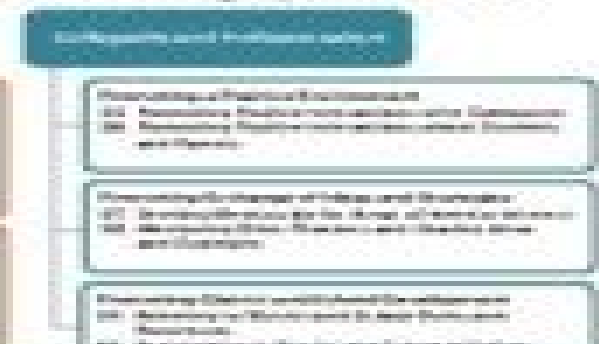
Figure 2: Overview of Instruction Map

The course is designed to provide a comprehensive understanding of the field of education, including the history, theory, and practice of teaching. The course will focus on the following areas: