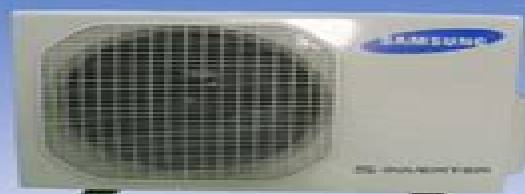
AQV09A * AX, AQV12A * AX