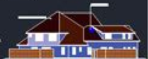
SIDE ELEVATION 1/4\"/>