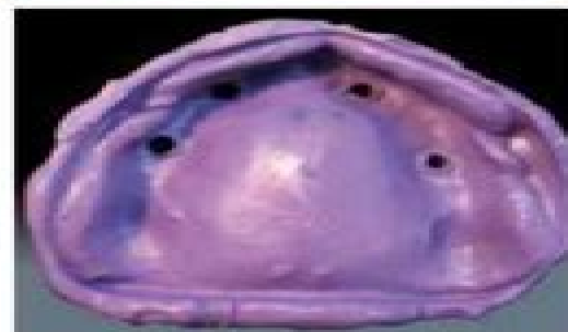
Fig. 1 & 2 Preliminary implant level impression