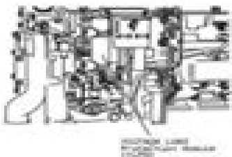
FIGURE 1 Front View