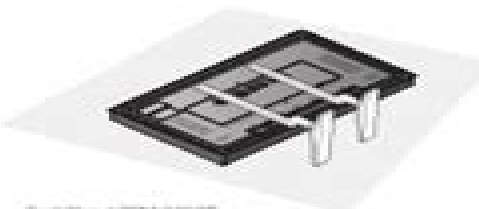
Part No. : SMTA-2000